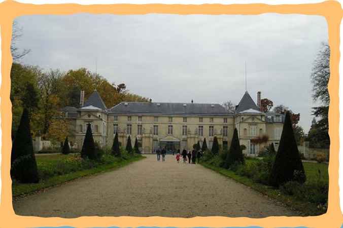
Chateau de Malmaison