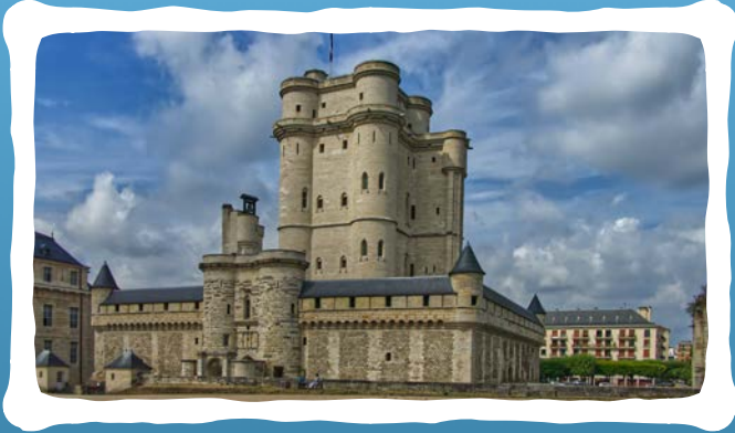
Chateau de Vincennes