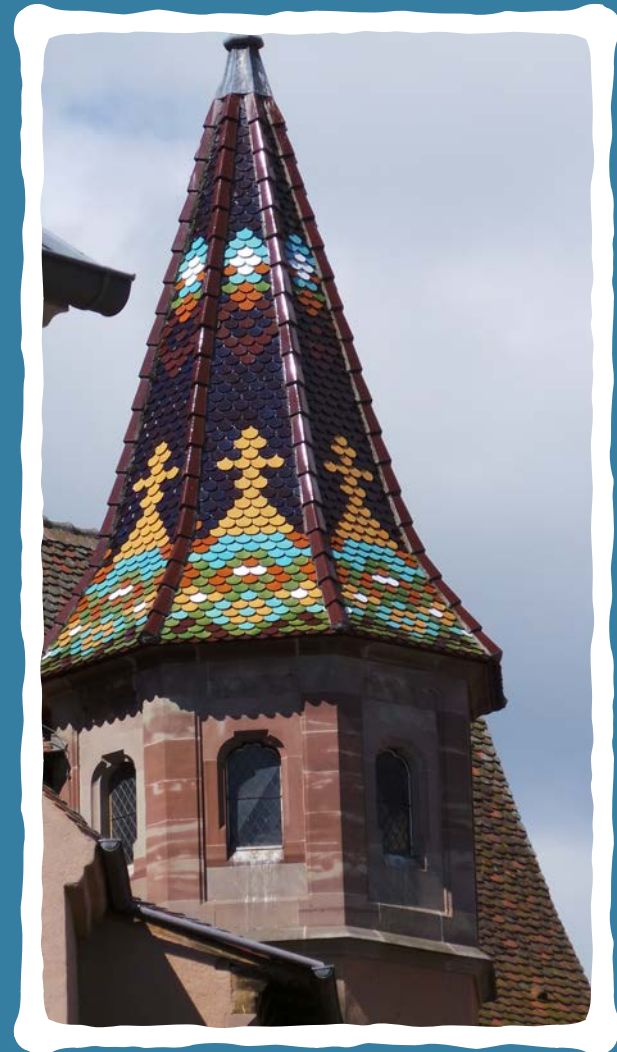
Church spire, Eguisheim

Any payment made after May 25 will be assessed a late fee of $250 and must be made by cashier's check, or credit card. ESA reserves the right to cancel, with appropriate penalties, any registration which has not completed all payments by May 25, 2024. All required documents and photos must be submitted to ESA by May 25. All prices reflect exchange rates in effect at the time of publication (September 2023) and are subject to change.