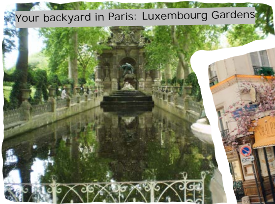
Your backyard in Paris: Luxembourg Gardens