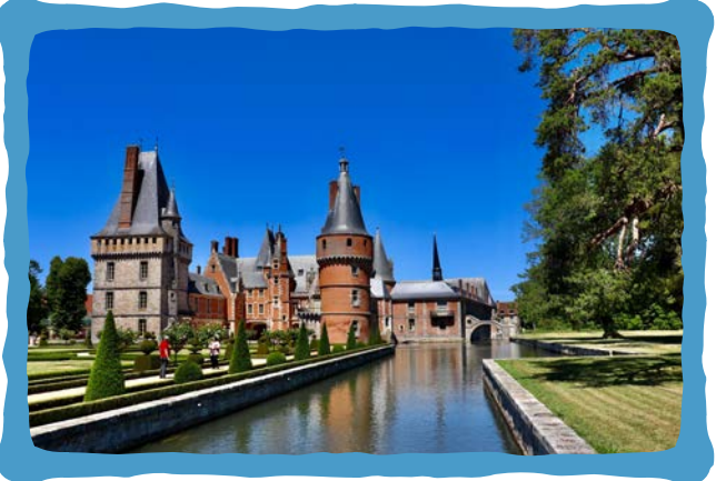
Chateau de Maintenon