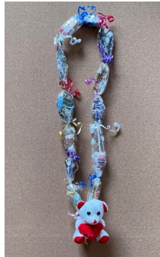
Candy Lei $15 With small bear