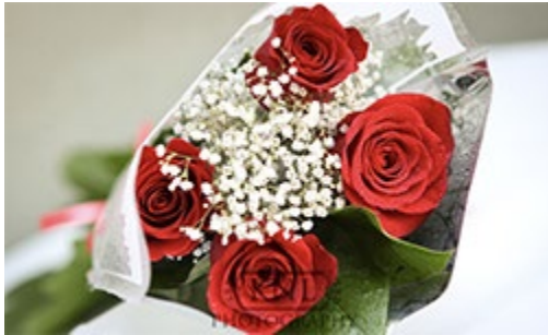
Rose Bouquet $10.00