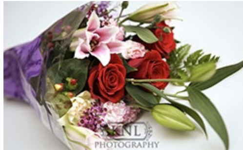
Fancy Bouquet $20.00