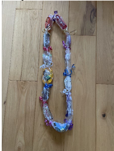
Candy Lei $10