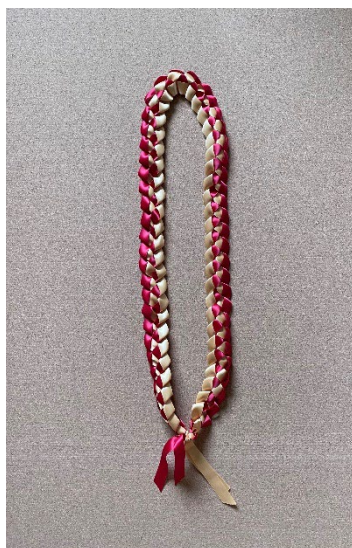
Ribbon Lei $20 Red/Gold (School color)