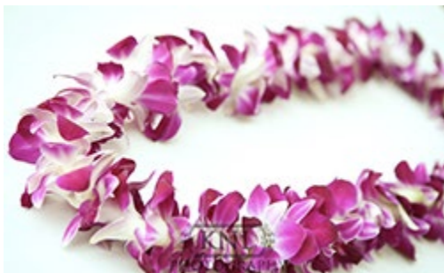
Single Purple Orchid Lei $25