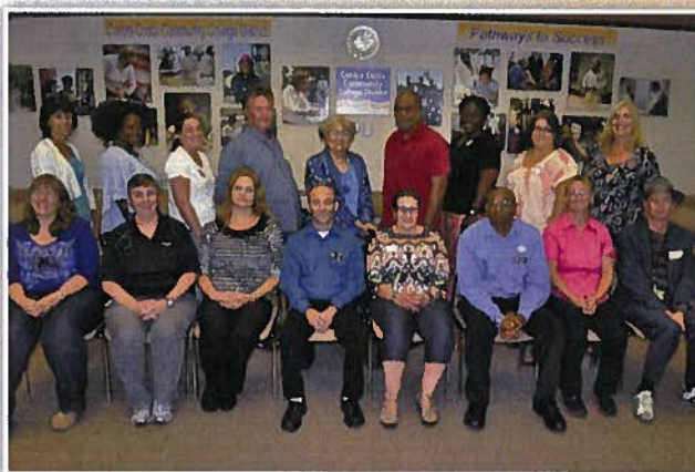
Back row (left to right):