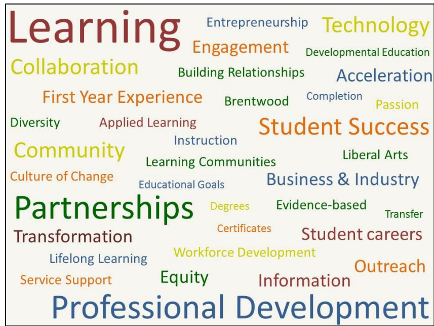
Word Map of “Big Ideas” from Opening Day