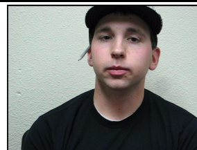
Table Task #2-Share Out

What did your student services department do to support and retain your student?