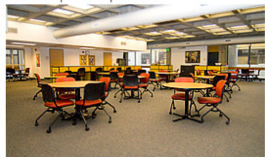
CO3 - The CORE: Center for Academic Support