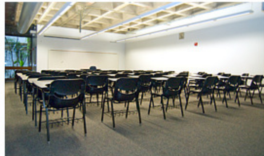
CO1 - "Smart" Classrooms

The third floor, CO3, is where you'll find " The CORE: Center for Academic Support ", formerly known as the Reading and Writing Center. This is a space for students to seek out academic support