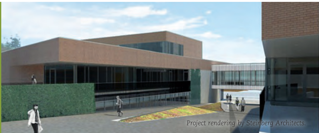
Project rendering by Steinberg Architects.

DVC students on campus (top); construction on a handrail and walkway that are part of a more gradual, inviting north entry (above, left, and at right), designed to welcome students and visitors to the new Commons area and other parts of campus. A covered, connecting walkway (above, right) joins the Commons' north and south wings. For updates, visit the project webcam at dvc.edu/org/facilities/projects/ .