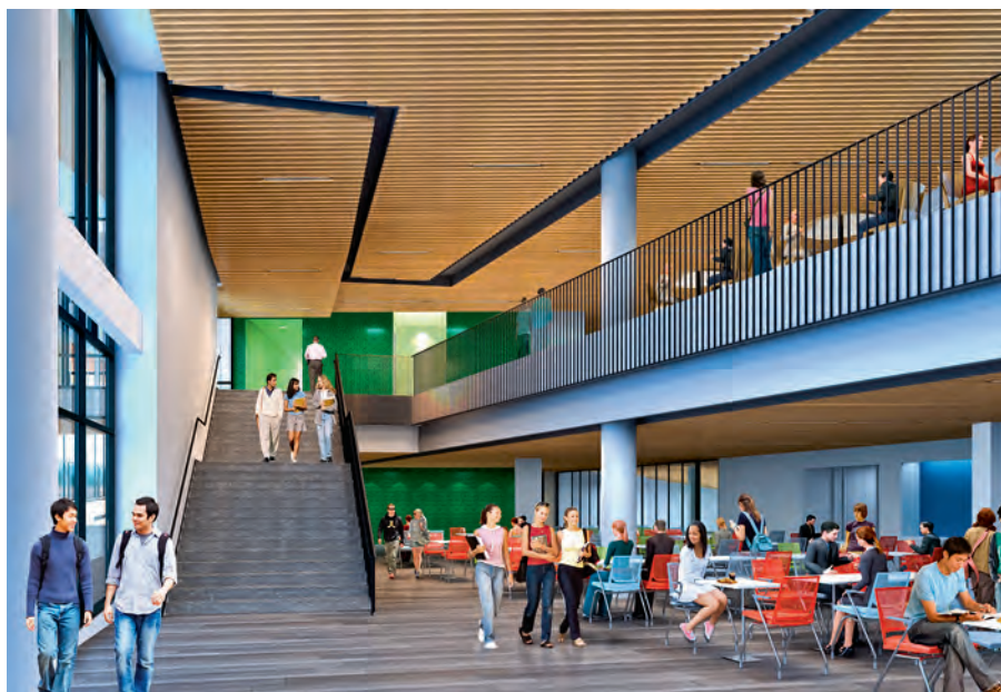
Top: Groundbreaking of the CCC College Center project, which will include a new Classroom building. Right: Culinary Arts on the upper floor and the Food Services Dining Room on the lower floor of DVC Commons' north wing. Bottom: LMC College Complex project. Project renderings by Steinberg Architects and tBP/Architecture.

The $73-million Contra Costa College Center project is the District's largest construction project to date. Scheduled for completion in fall 2016, the College Center includes a new Student Activities building, a new Classroom building, and a new Quad area. At Diablo Valley College, four of the six phases of the $53-million Commons project are projected for completion in May 2014. At Los Medanos College, project work continues on the Student Services area renovation of the College Complex.