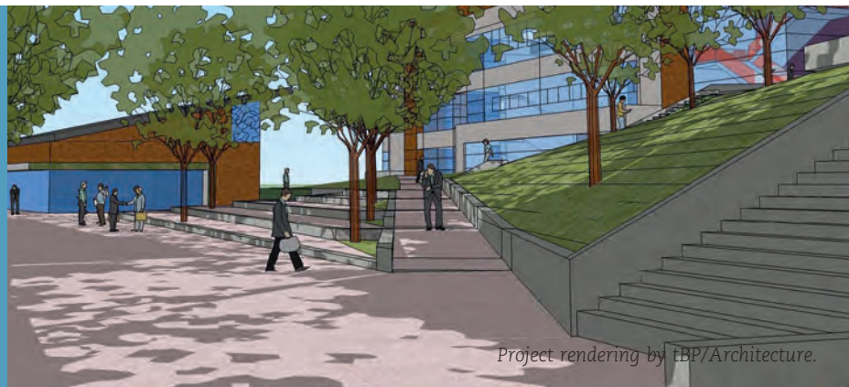
Project rendering by tBP/Architecture.

CCC students on campus (top); completed projects in 2013 included a new ADA-compliant space in the parking lot of the Knox Performing Arts Center (above), and the interior spaces and installation of equipment in the renovated Music building (above, right). The campus also broke ground on a new Student Activities building in the College Center (right).