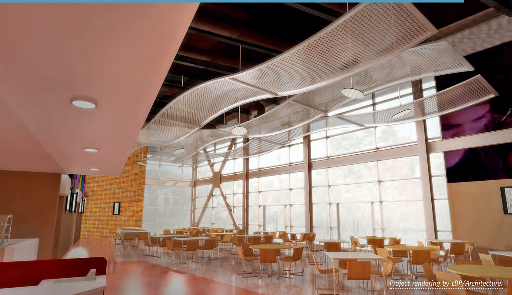
Project rendering by tBP/Architecture.