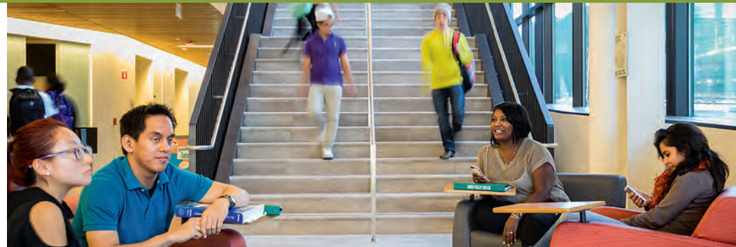
Top: Los Medanos College students spend time on the campus Quad. Center: Diablo Valley College students enjoy the inviting spaces of the Commons' Student Services Center Counseling area. Bottom: Rendering of Contra Costa College Student Activities building dining area.