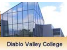
Diablo Valley College