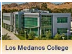
Los Medanos College