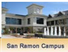
San Ramon Campus