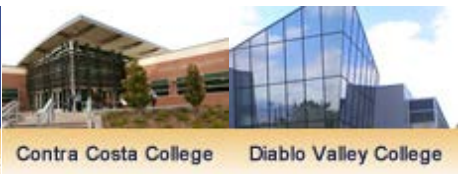
Contra Costa College