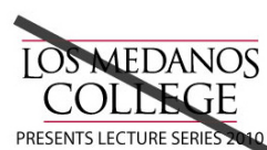
Usage of logo to create a sentence

Wherever and whenever the logo appears, it should always be clear and visible. Care should be taken in controlling the background it is presented on to optimize legibility.