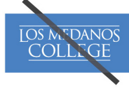
Alternate background color