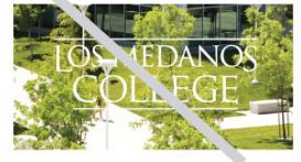
Busy Photographic backgrounds