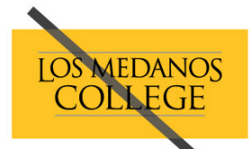
Usage of grey scale logo on background color